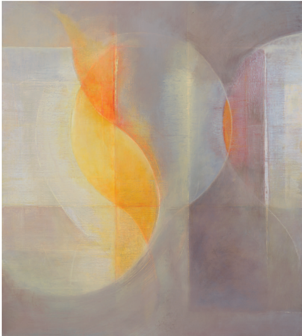
Spinning Tales Oil on linen 100 x 90 cm