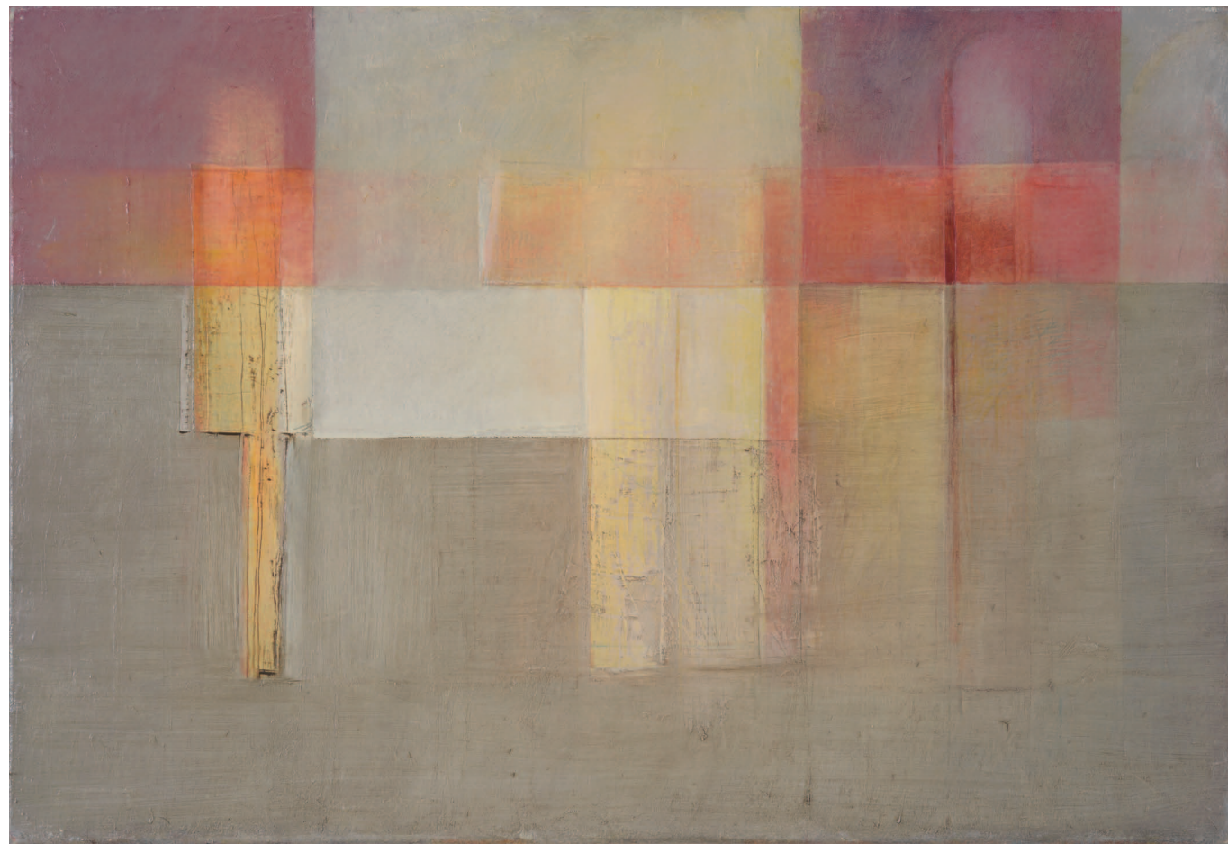
Verona II Oil on cotton 50 x 75 cm