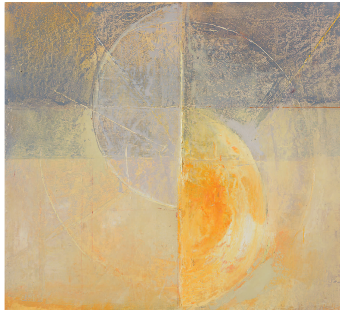
The Halves Oil on board 39 x 45 cm