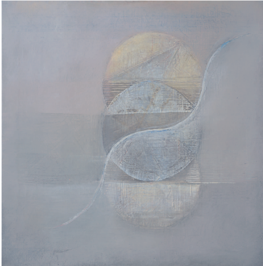
Between Three Oil on linen 60 x 60 cm