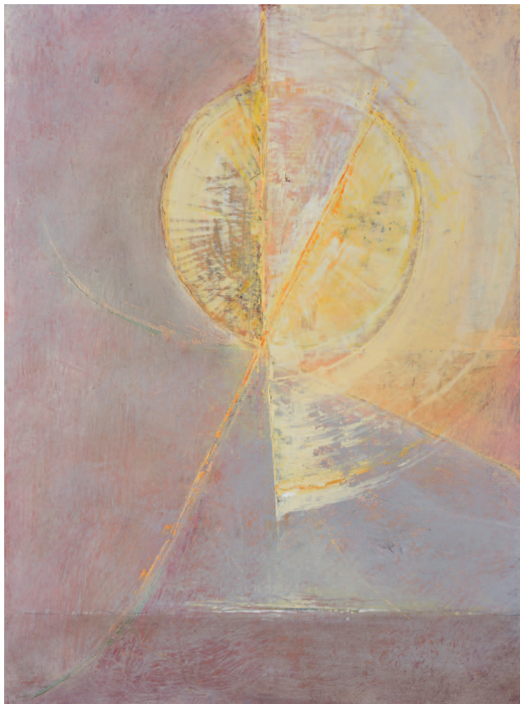
After Twelve Oil on board 51 x 38 cm