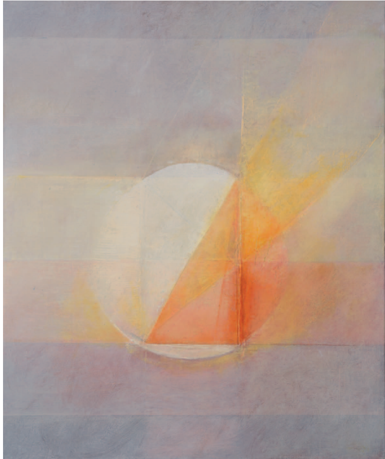
Watch The Day Oil on linen 76 x 64 cm