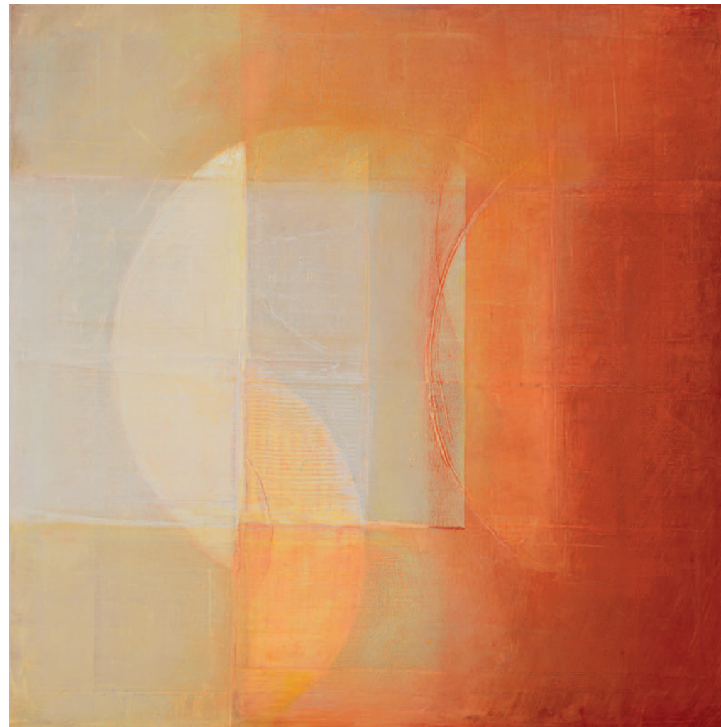
Poet's Place Oil on cotton 60 x 60 cm