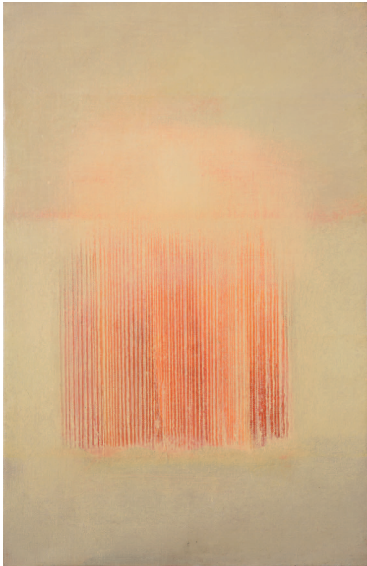
Time Lines Oil on linen 58 x 38 cm