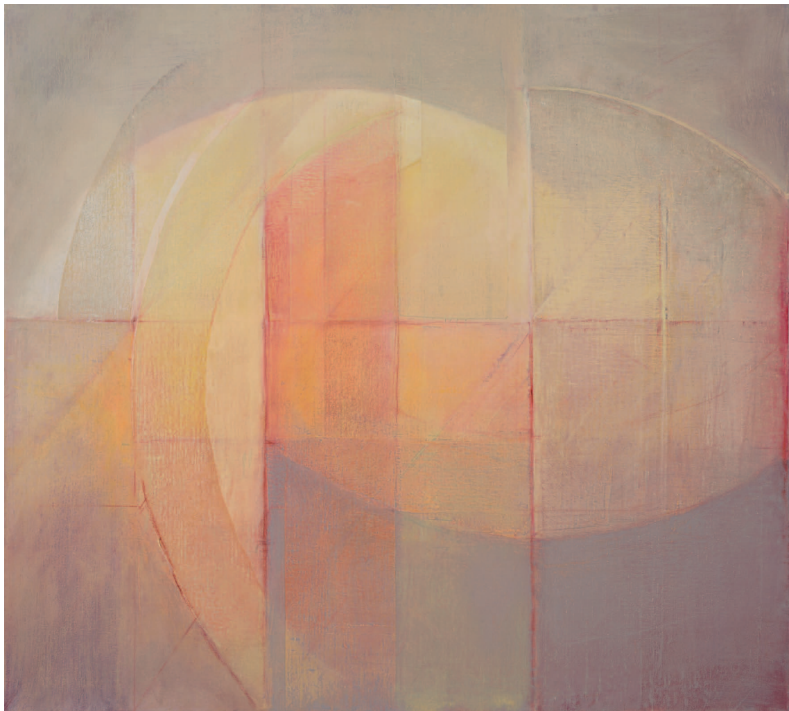
Points In Time II Oil on linen 77 x 85 cm