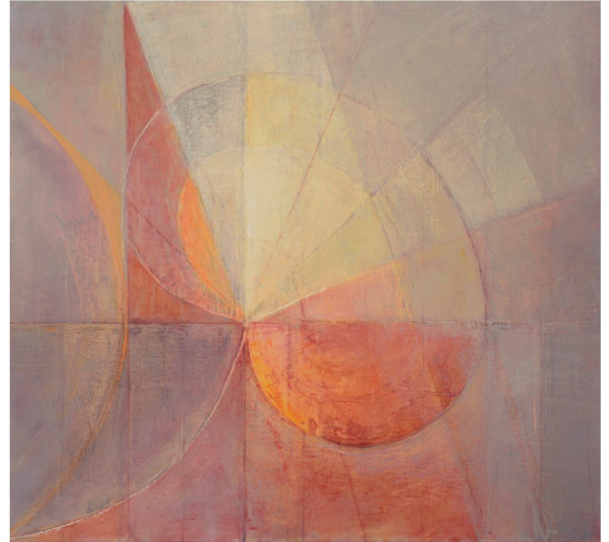
Spire Oil on linen 92 x 102 cm