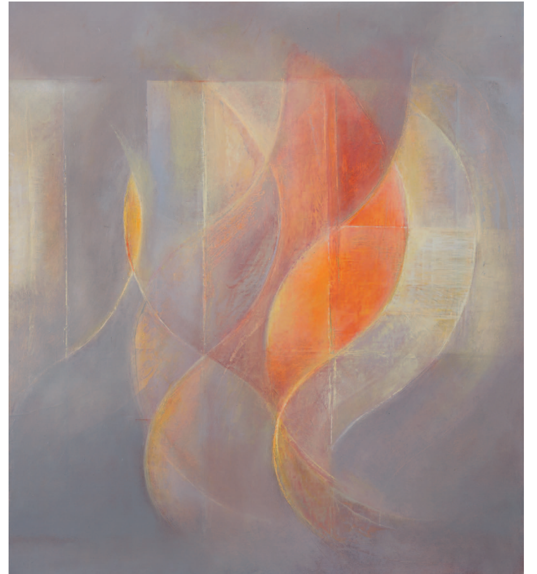
Spinning Tales II Oil on linen 100 x 90 cm