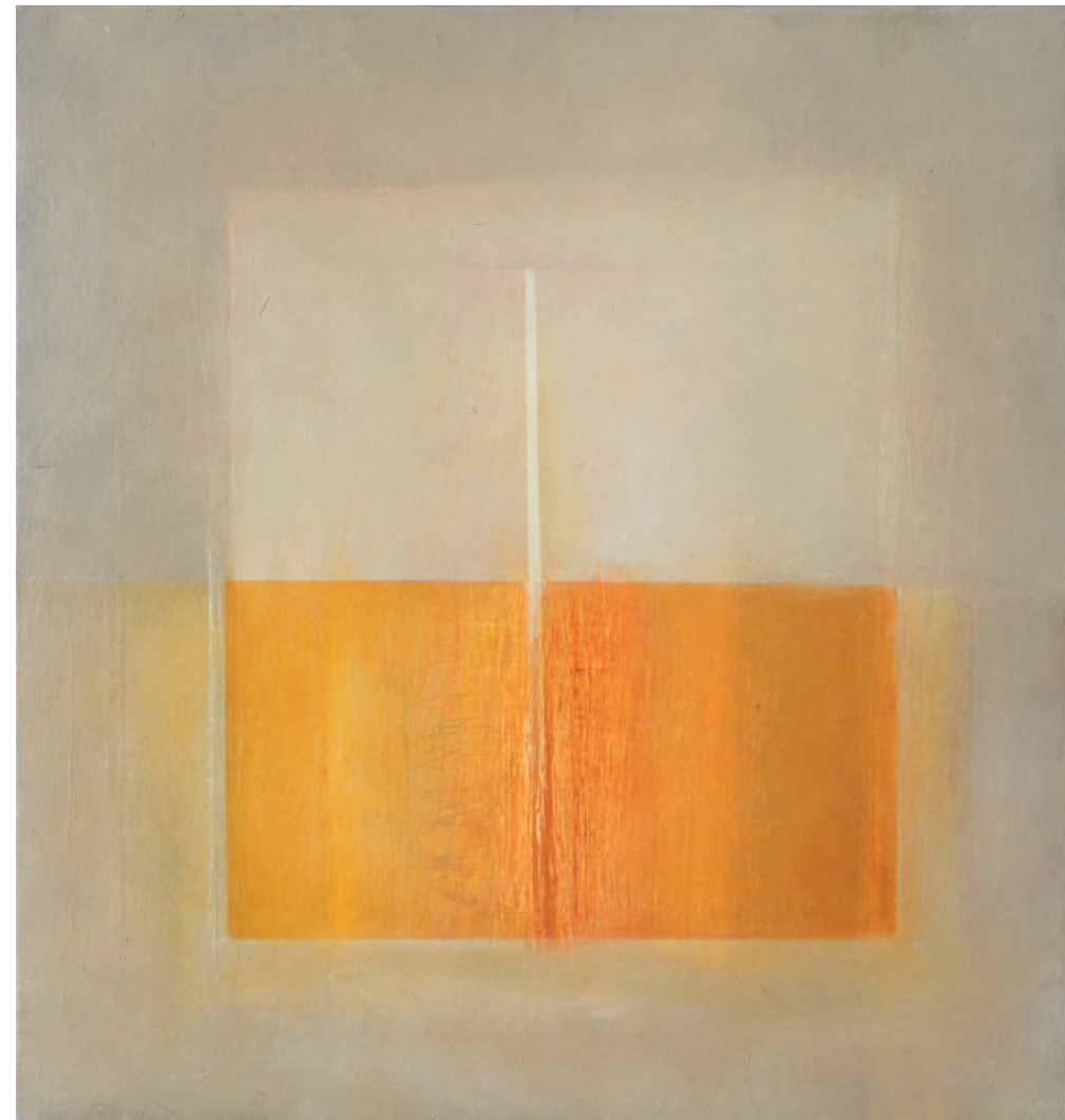
Twofold Oil on linen 43 x 40 cm