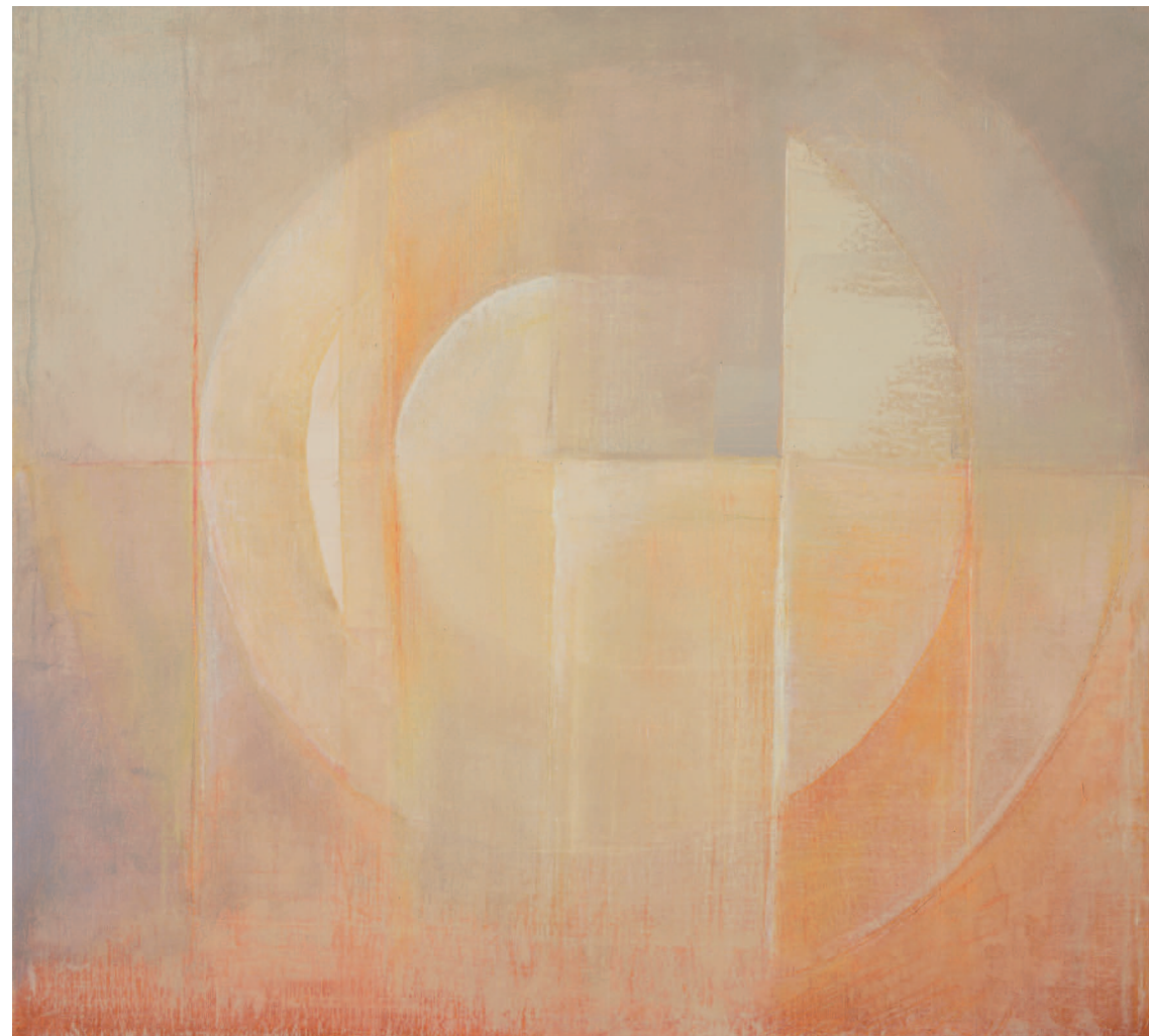
Points In Time III Oil on linen 77 x 85 cm