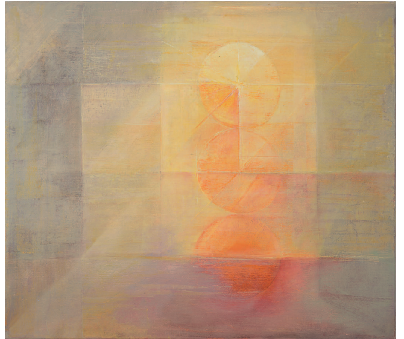
Hours In Balance Oil on linen 100 x 115 cm