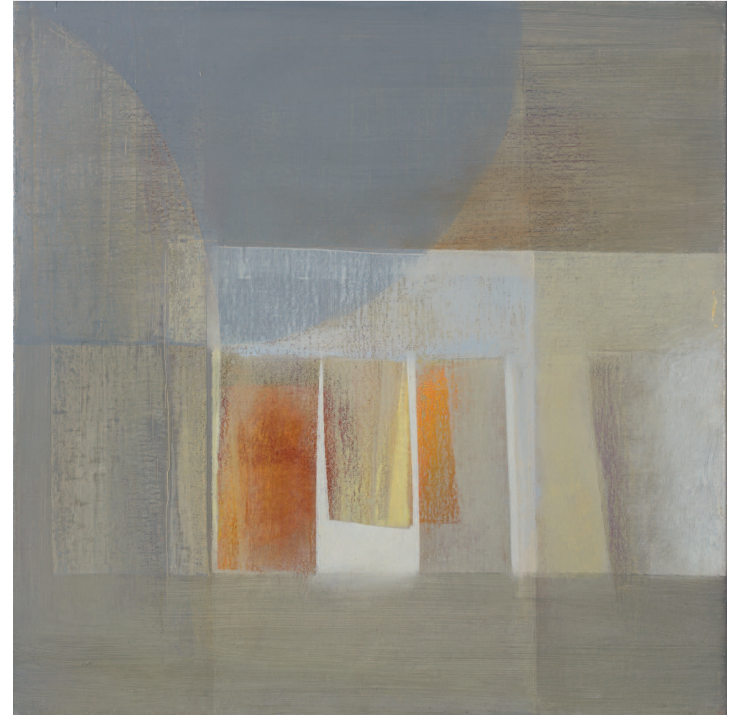
Unison Oil on linen 55 x 55 cm